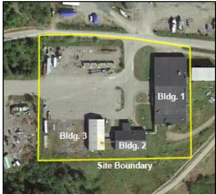
Boat School Site Diagram

According to results documented in a report titled Hazardous Materials Assessment Report, 16 Deep Cove Road, Eastport, Maine , dated August 10, 2020, outstanding environmental hazards at the Site include ACM, universal waste, and small quantities of potentially hazardous chemicals including paints, solvents, and petroleum related products.